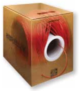
With a size (12" x 13" x 9") and a weight (24 lbs) that are familiar to installers, these boxes can be easily handled by a single technician